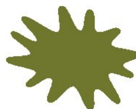
Trees/ Grass Highlight